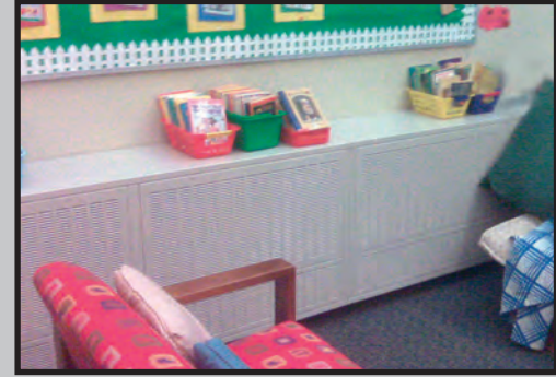
Summit Elementary School Winston-Salem, North Carolina