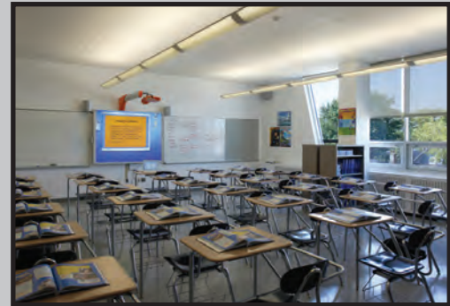
Commodore John Barry Elementary Philadelphia, Pennsylvania LEED® Gold