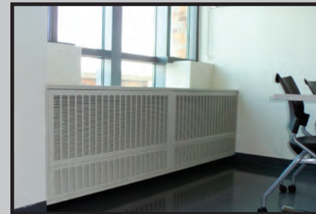
St. John's University D'Angelo Hall Queens, New York