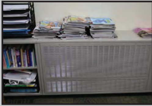
South Education Center - ID287 Richfield, Minnesota LEED® Certified