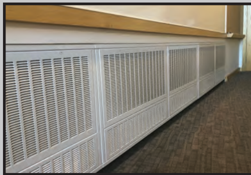
Hudson Valley Community College Troy, New York