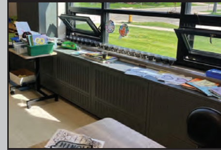
Merrill Elementary School Beloit, Wisconsin

“ The QLCI provided a single product that is under the control of the mechanical contractor while delivering an effective displacement ventilation solution.