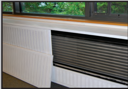
Bridgewater State University Bridgewater, Massachusetts LEED® Silver