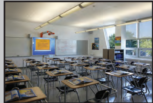
Commodore John Barry Elementary Philadelphia, Pennsylvania LEED® Gold