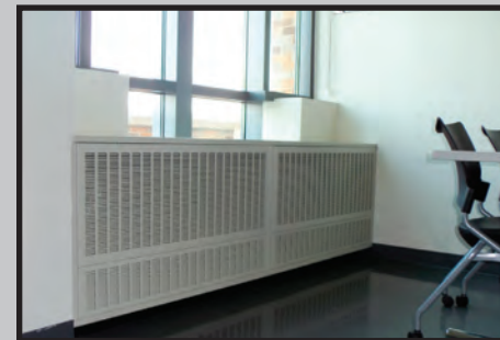
St. John's University D'Angelo Hall Queens, New York