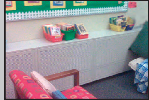
Summit Elementary School Winston-Salem, North Carolina