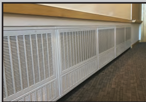
Hudson Valley Community College Troy, New York