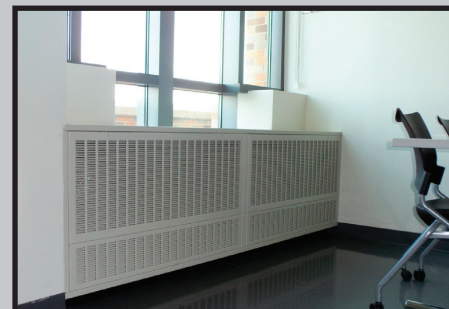
St. John's University D'Angelo Hall Queens, New York