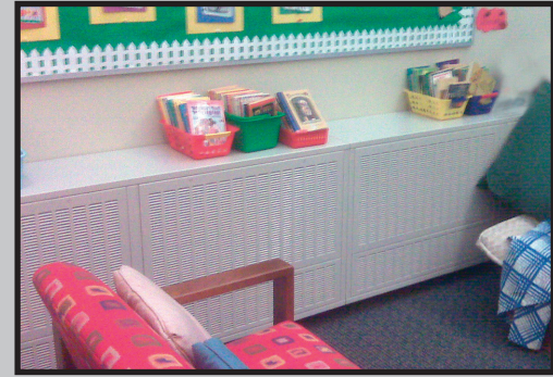
Summit Elementary School Winston-Salem, North Carolina