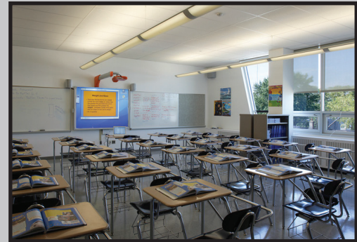
Commodore John Barry Elementary Philadelphia, Pennsylvania LEED® Gold